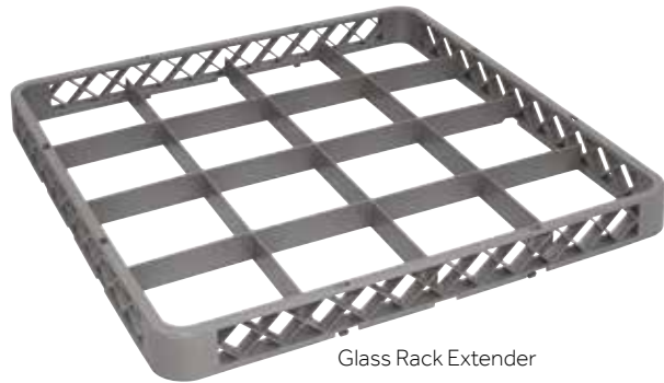
Glass Rack Extender